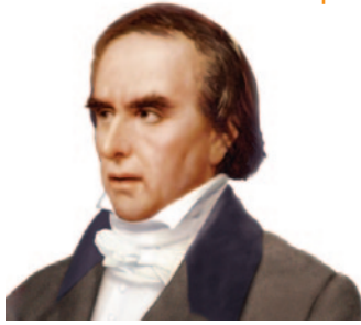
New Hampshire congressman Daniel Webster was a leading Federalist. He openly criticized war against the British and the violation of New England's shipping rights.

for settlement. Others were angered by British trade restrictions that hurt southern planters and western farmers. The War Hawks gave emotional speeches urging Americans to stand up to Great Britain.