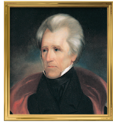
Andrew Jackson earned the nickname "Old Hickory" during the War of 1812. Soldiers called him that because he was strict. They said he was as tough as the wood of a hickory tree.

Jackson's presence in Florida convinced Spain to negotiate with the United States over the ownership of Florida. On February 22, 1819, U.S. Secretary of State John Quincy Adams, son of John and Abigail Adams, and Spanish diplomat Luis de Onís signed the Adams-Onís Treaty , which settled all border disputes between Spain and the United States. Spain agreed to give Florida to the United States. In return, the United States gave up its claims to what is now Texas and agreed to pay up to $5 million of U.S. citizens' claims against Spain.